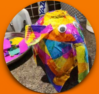
A fantastic Elmer made from a milk carton - A Reception home learning challenge.